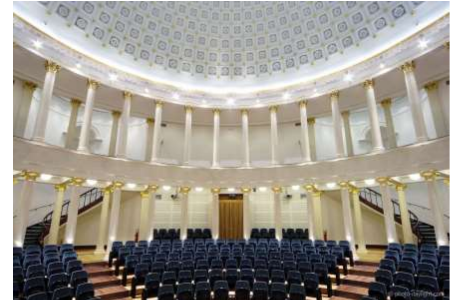
Salle Académique, finished in 1824.