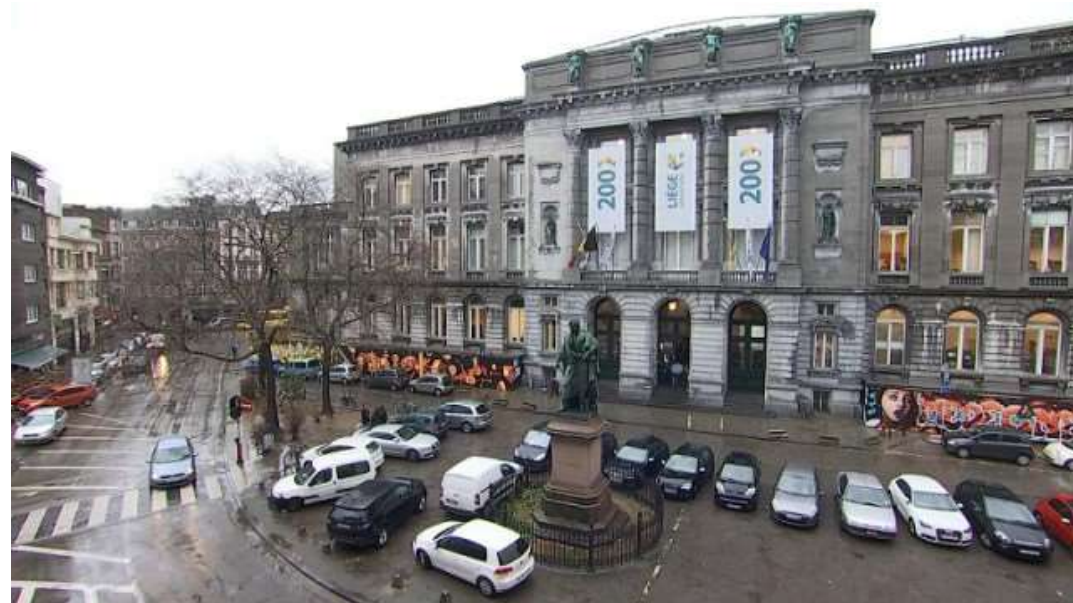
University of Liège, created in 1817 on the remains of the medieval College of of the Brethren of the Common Life (1496).